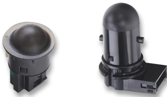
Figure 1: Solar Sensors